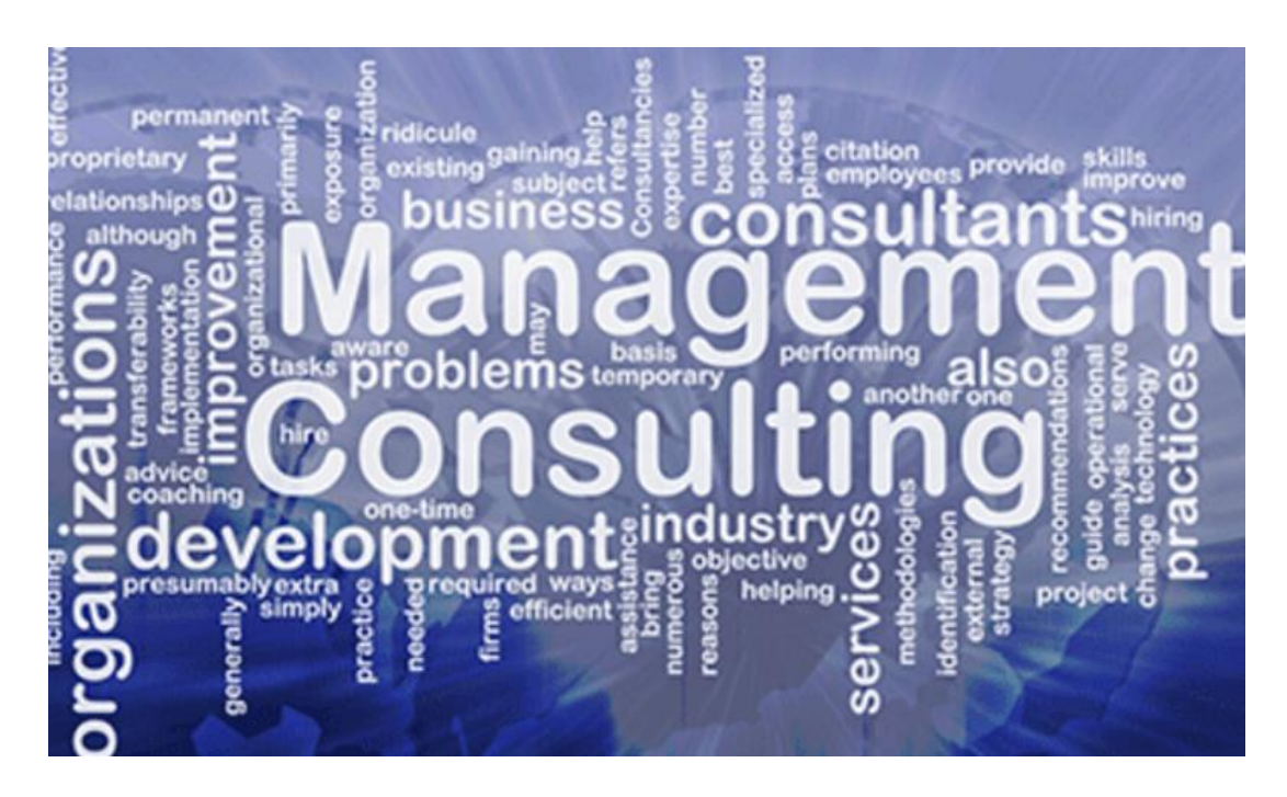
The A.T. Kearney team is made up of more than <u>3,600 people</u>, and there are <u>more than 20,000 individuals</u> that comprise the professional and alumni network.