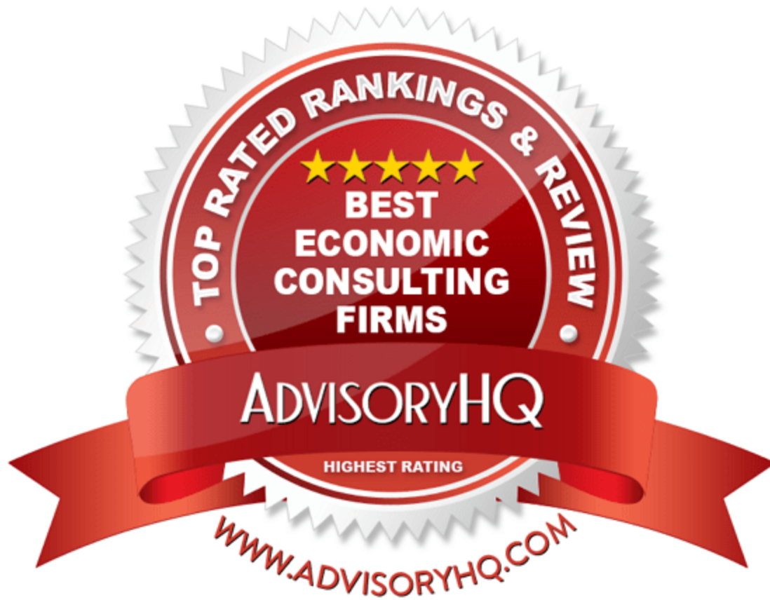
Award Emblem: Top 6 Best Economic Consulting Firms

The value that many see in economic consulting firms is the insight that they can provide into the future.