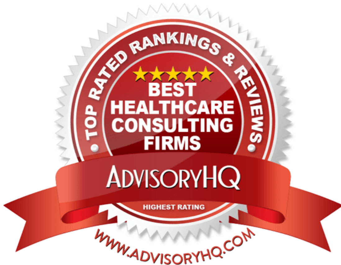
Award Emblem: Top 6 Best Healthcare Consulting Firms