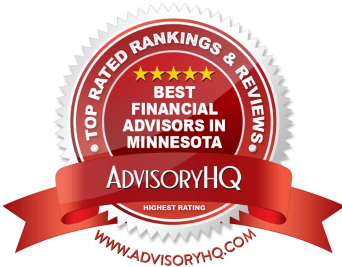
Award Emblem: Top 10 Best Financial Advisors in Minneapolis, St. Paul, and Edina (Minnesota)