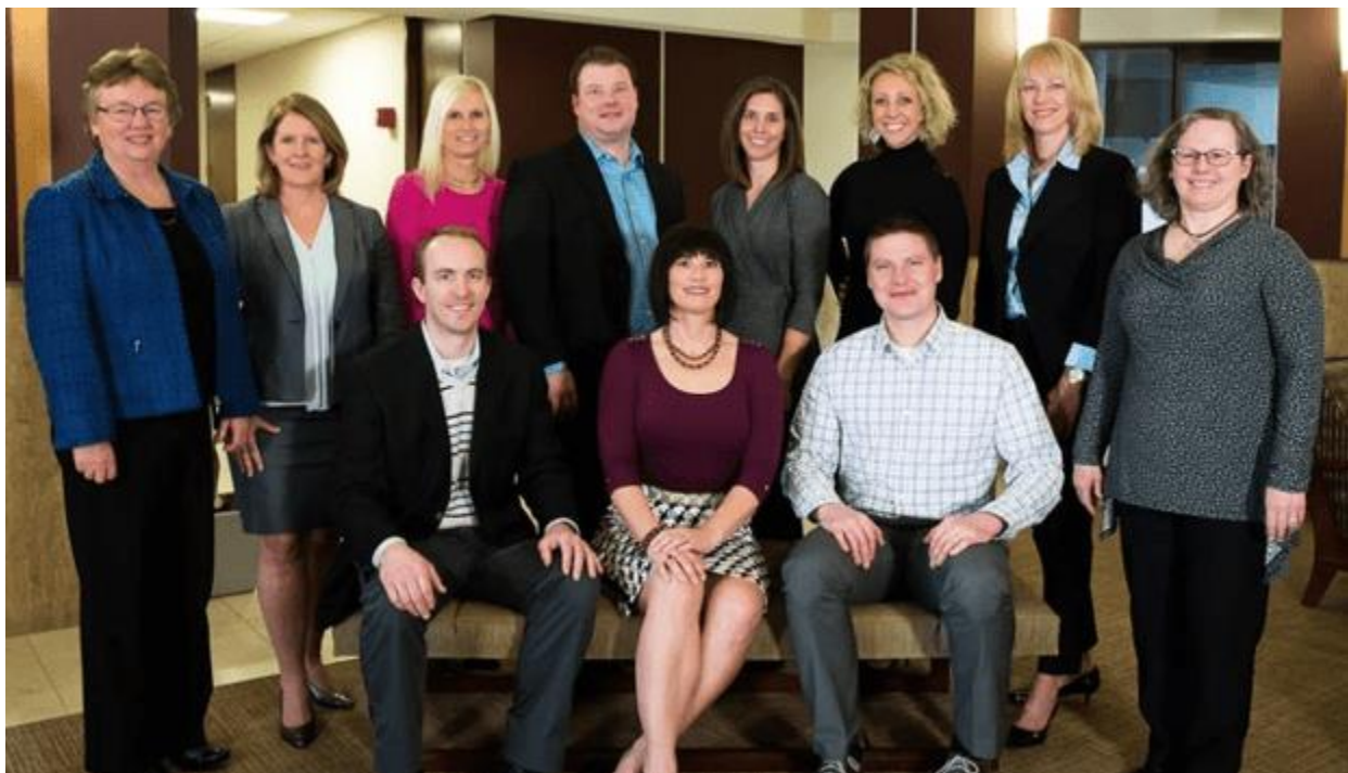
Best Financial Planners in Minneapolis