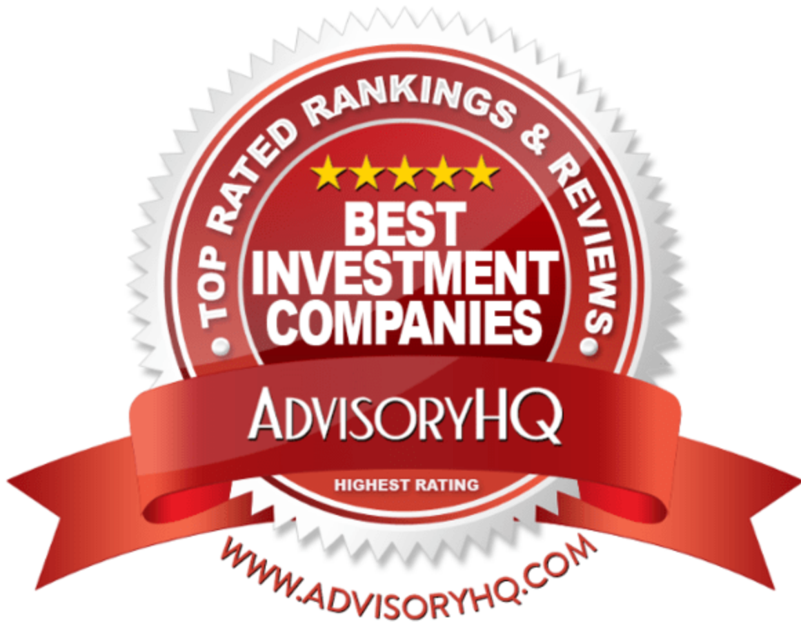
Award Emblem: Top 11 Best Investment Companies

As the largest investment firms, these traditional brokerages tend to be inexpensive and provide options to combine personalized, in-person advice with online trading capabilities.