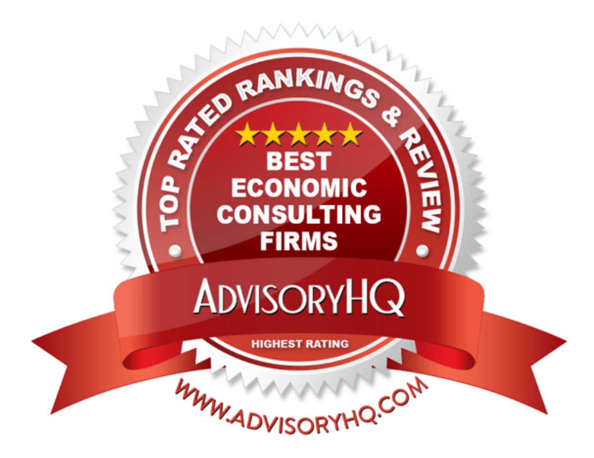
Award Emblem: Best 7 Economic Consulting Firms (& 1 to Avoid)

The value that many see in economic consulting firms is the insight that they can provide into the future.