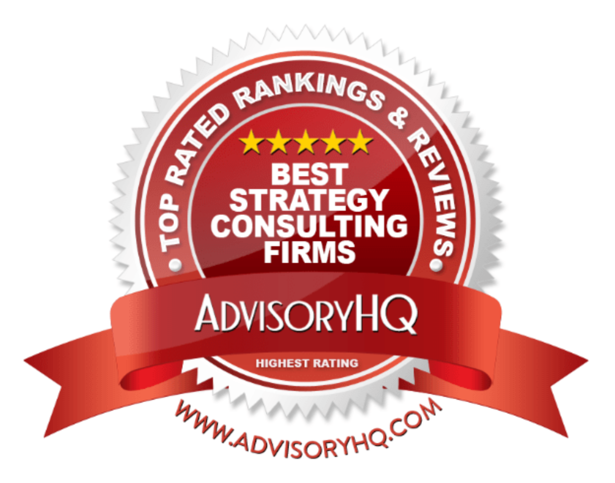
Award Emblem: Top 11 Best Strategy Consulting Firms