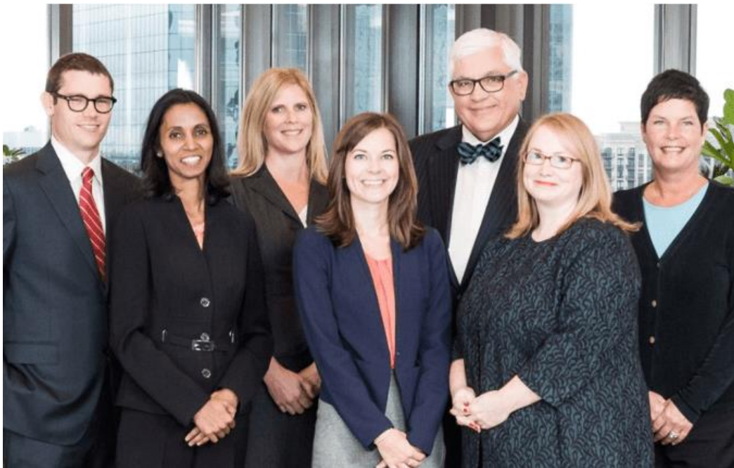
Best Minneapolis, MN Financial Advisors

Non-investment services can be priced hourly, by project, or with a retainer, allowing a wide range of flexibility.