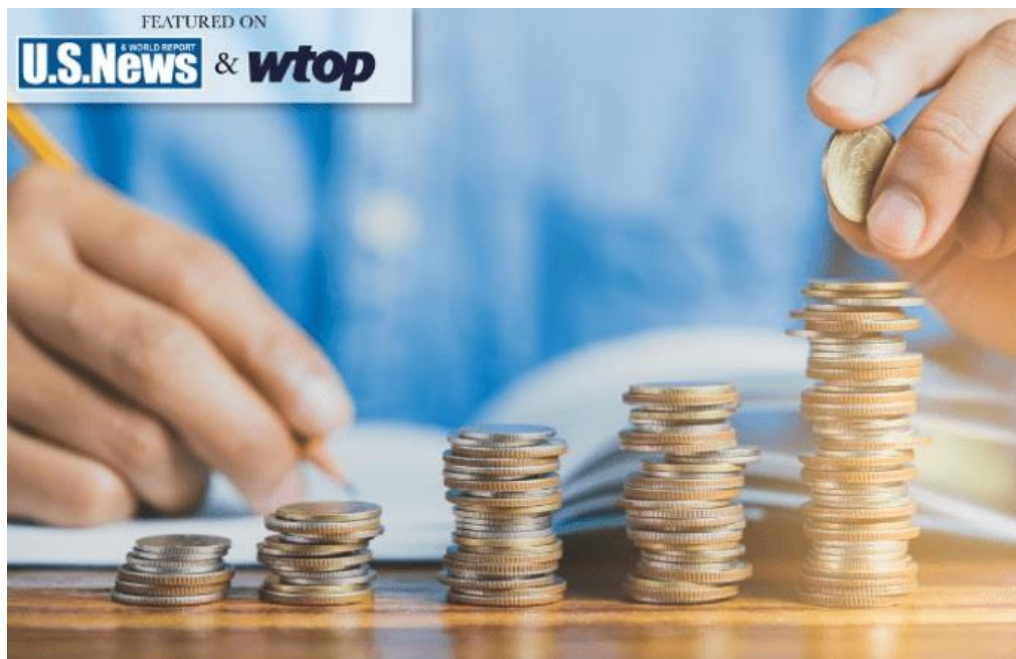
Best Financial Planners in Minneapolis

Reviewing existing insurance coverage is part of their risk management process for financial management. They do not accept any commissions or referral fees for any of the financial products they offer and work with independent insurance brokers to purchase the right insurance to meet a client's individual needs.