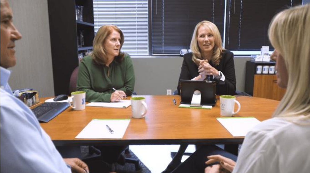
Top Financial Planners in Minneapolis