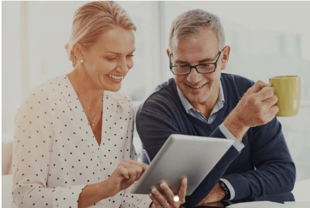
Top Financial & Tax Planning Services in Minnesota