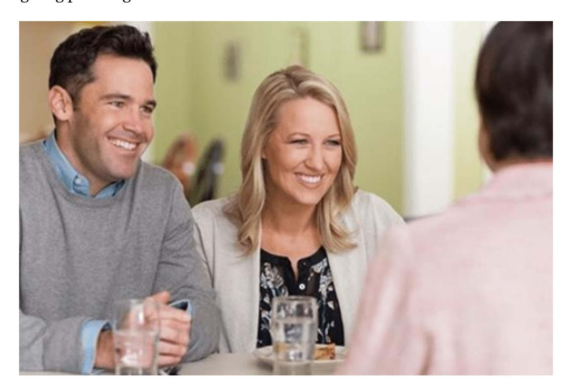
Iowa's Best Wealth Management Firms 2019