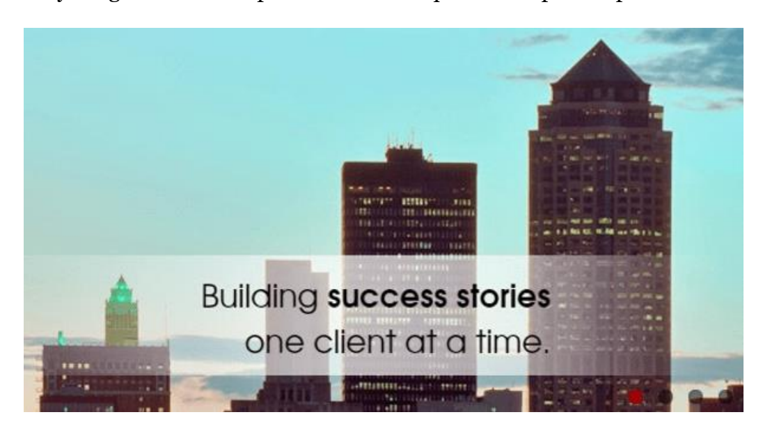
Des Moines, Iowa Top-Rated Financial Planning Firms