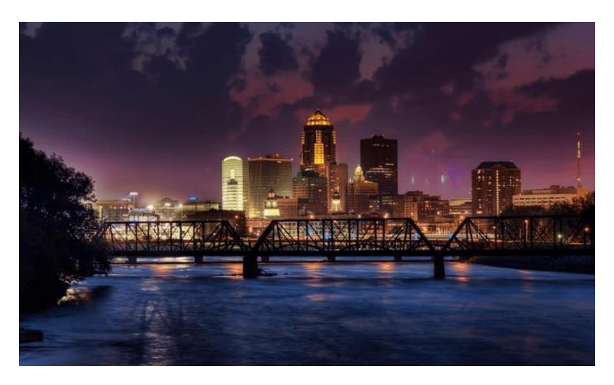
Top-Rated Financial Management Firms in Iowa 2019