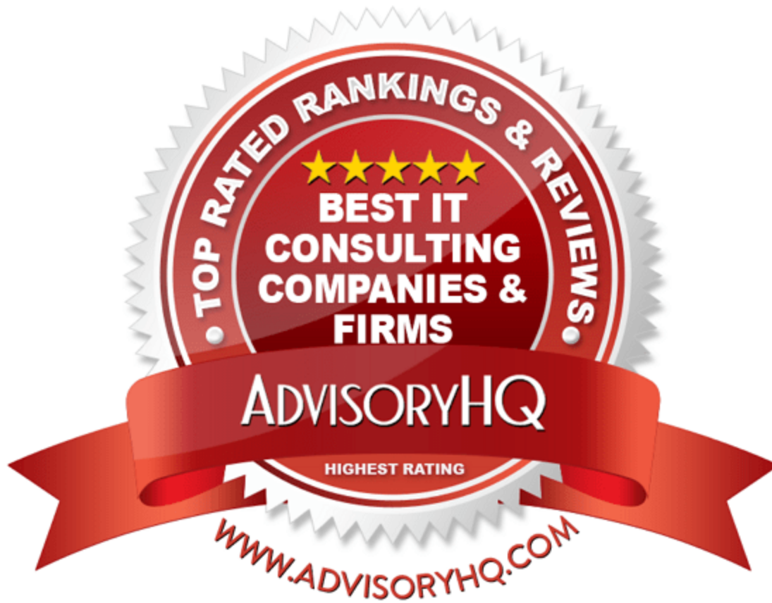
Award Emblem: Top 7 IT Consulting Companies & Firms