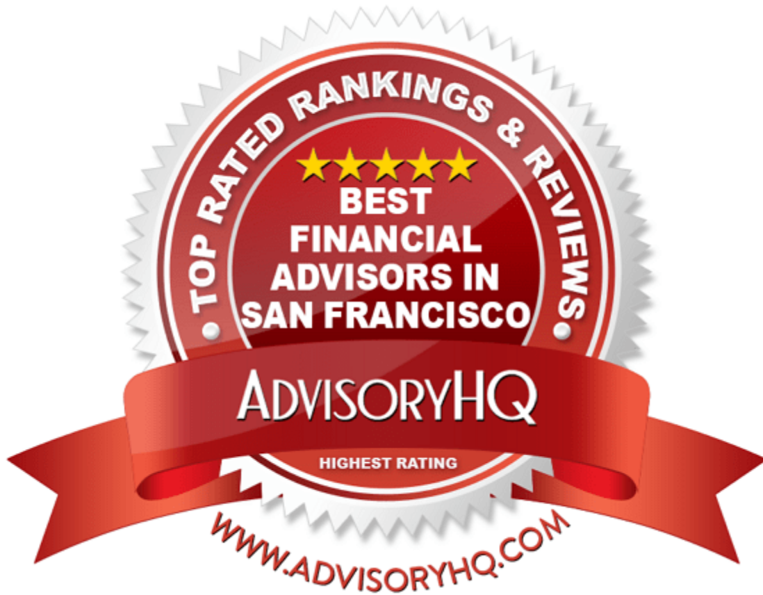
Award Emblem: Top 11 Best Financial Advisors in San Francisco