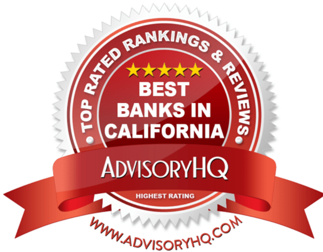
Award Emblem: Top 15 Best Banks in California

According to usbanklocations.com , there are currently more than 240 banks actively operating across Southern and Northern California, with almost 7,200 branch banking locations.