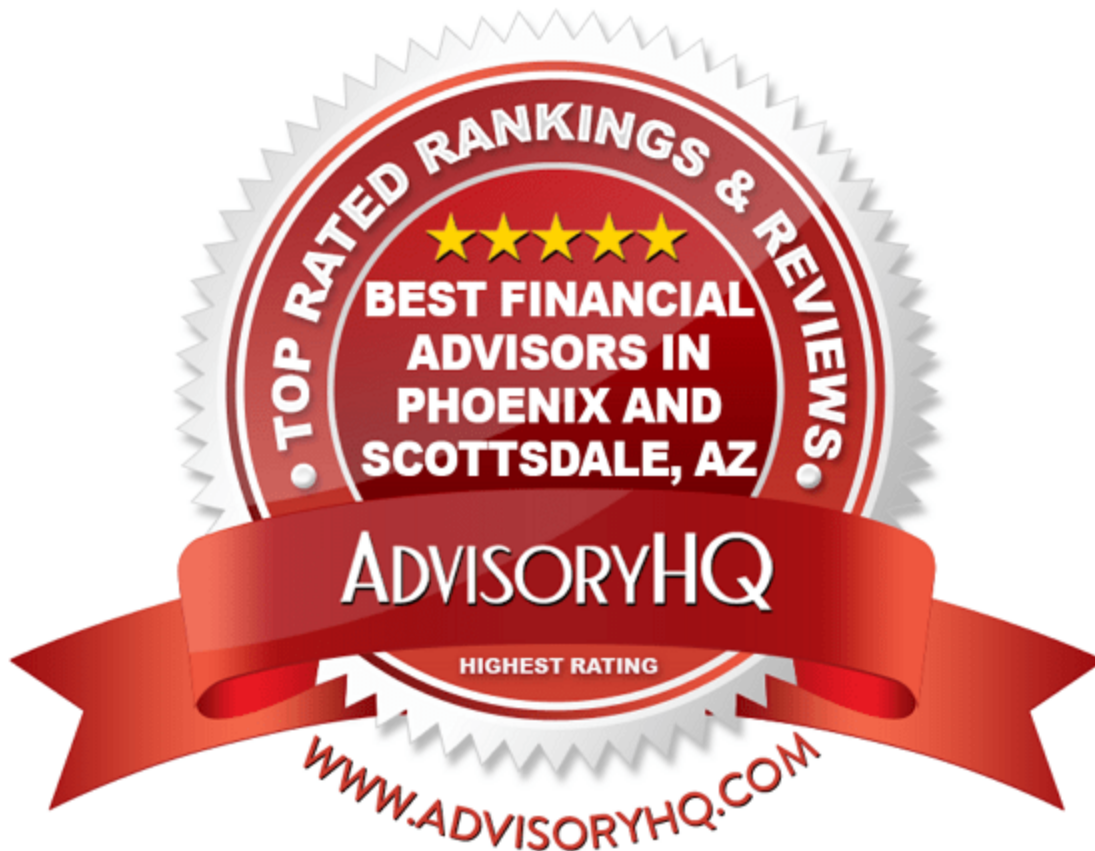
Award Emblem: Top 10 Best Financial Advisors in Phoenix & Scottsdale, AZ