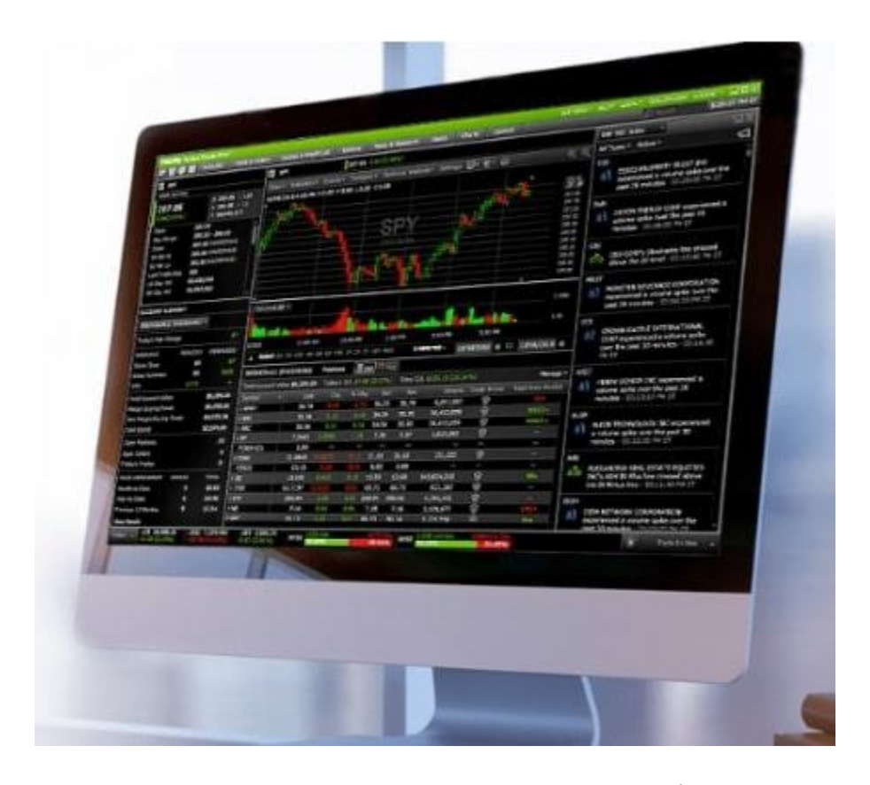
Largest & Best Investment Management Firms