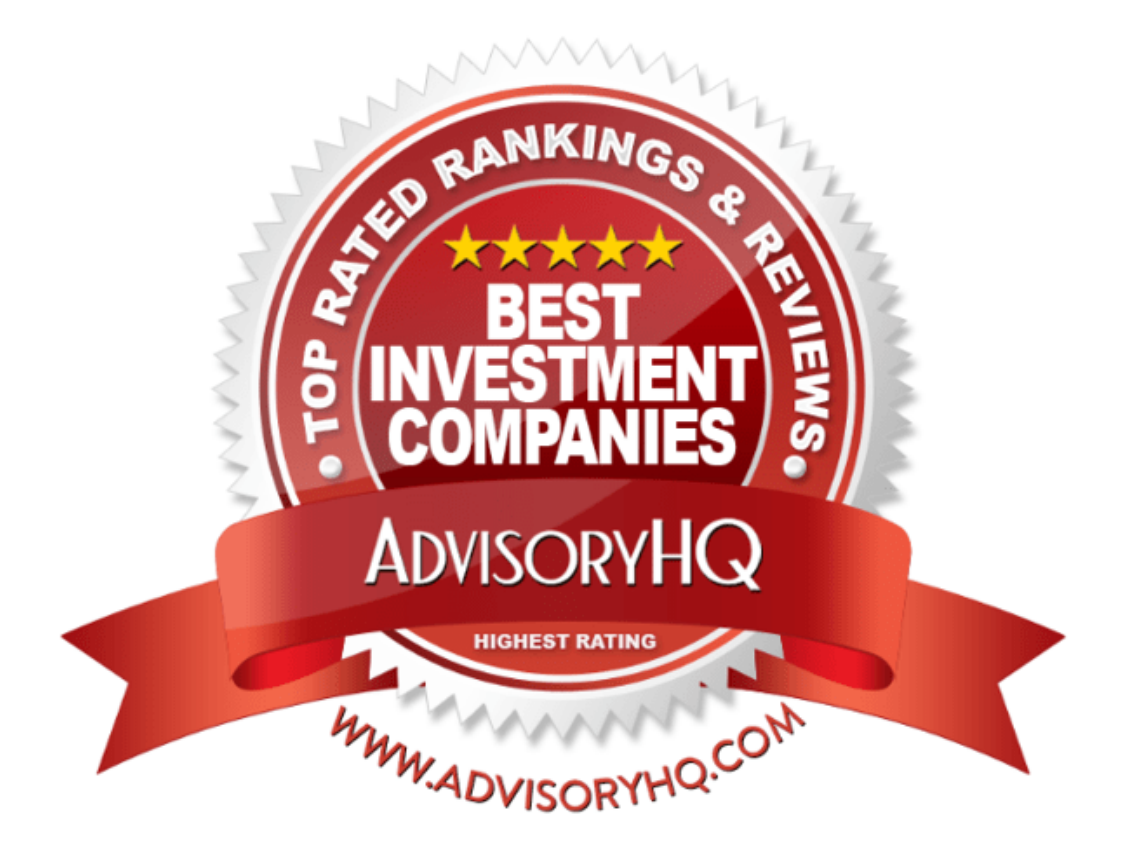
Award Emblem: Top 10 Best Investment Companies

AdvisoryHQ has reviewed multiple firms, and the following review and ranking of the best investment firms and the largest investment companies covers the popular traditional brokerages.