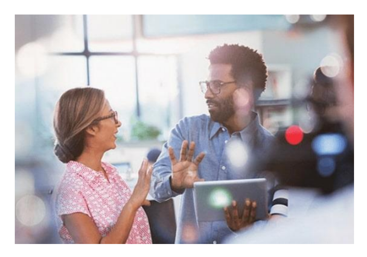
The Best and Largest Investment Firms